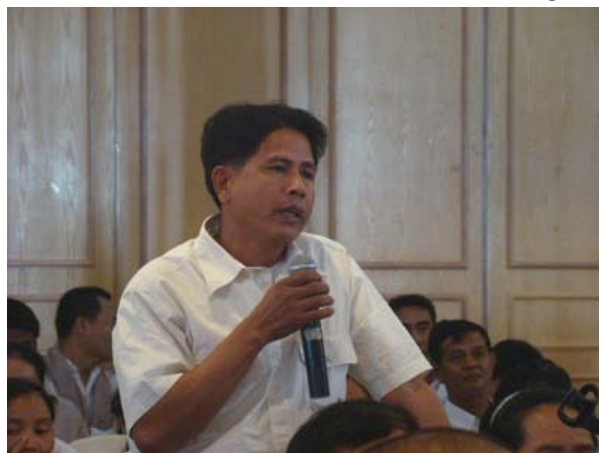
Another AKRVC officer.